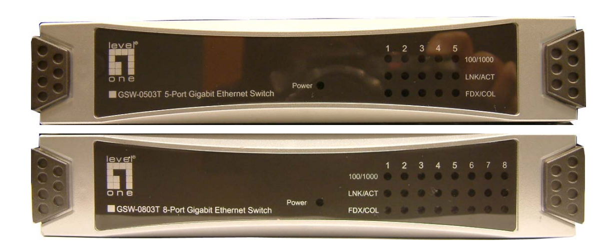
Figure 2-1. The Front Panel of the 5/8-Port Gigabit Switch

The Front Panel of the 5/8-Port Gigabit Switch consists of LED-indicators (100/1000, Link/Activity, Full duplex/Collision) for each Gigabit port and power LED-indicator for unit.